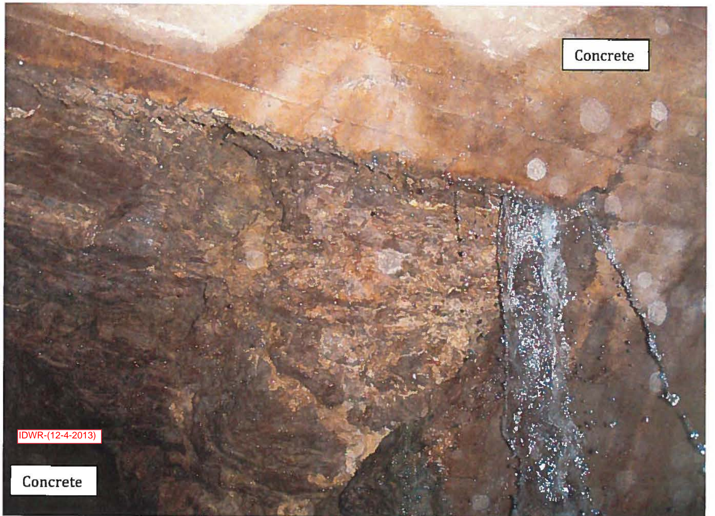
Photo 6 - Substantial leakage occurs at the Side Tunnel connection with the Main Tunnel.